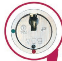
Lock in Deadbolt Position