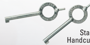
Standard Handcuff Key

Peerless® works with you to provide exactly the products you need.