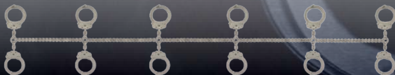
Six Station Prisoner Transport Chain