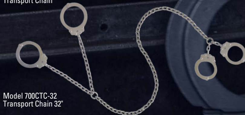
Model 700CTC-32 Transport Chain 32"

Peerless® works with you to provide exactly the products you need.