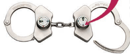
Model 710C Chain Link Handcuff