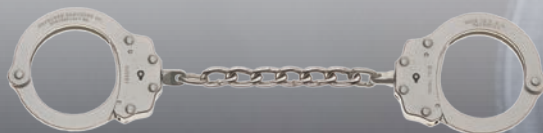
Model 700C-6X Extended Chain Link Handcuff

Peerless® offers restraints for special situations and custom chain work to meet specific requirements. These products are variations of standard models or use component parts from standard models in different configurations to create the right tool for the job. Custom restraints may be available with the high security lock option. Call 800-732-3705 to discuss how your special restraint needs can be met.